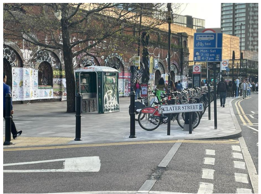
Sclater Street/Bethnal Green Road