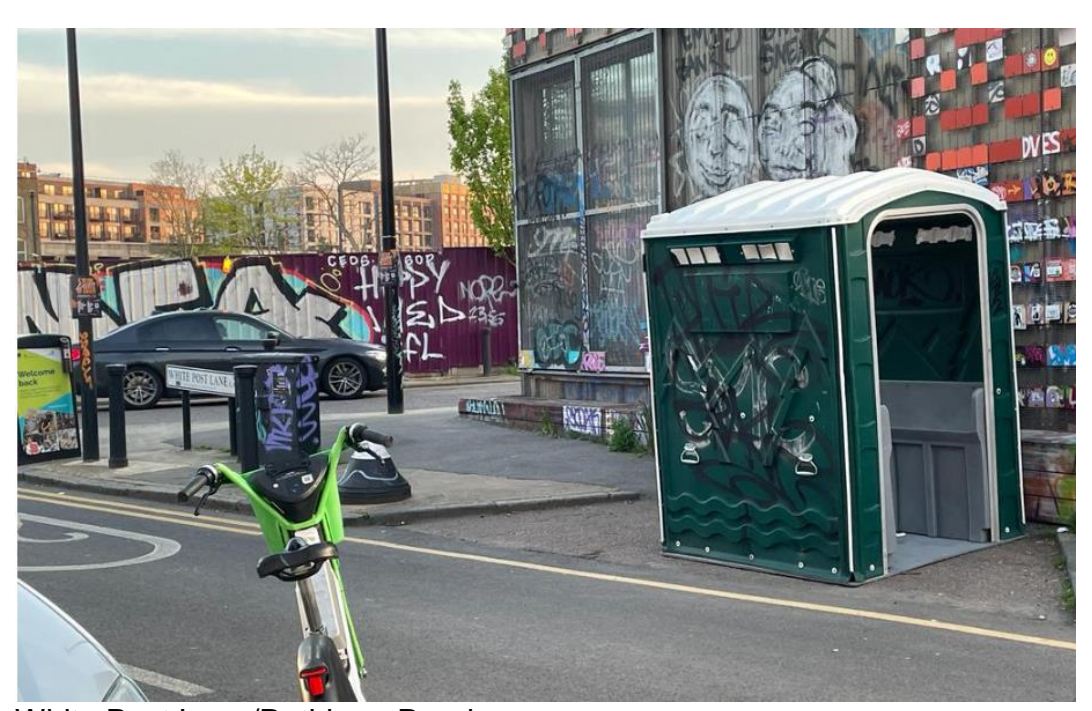
White Post Lane/Rothbury Road

5.36 The urinals are delivered to site on Friday and Saturday evenings and collected on the following morning between 4-5am to allow for street cleansing and ensuring no negative impact on the day-time economy. They also have a sign on them stated that they are funded on a trial basis by the licensed trade in the Borough.